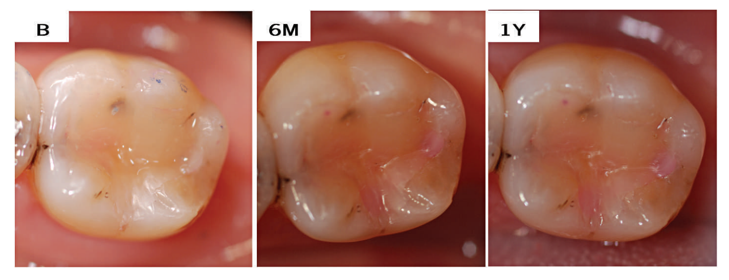
Figure 1. First molar. Occlusal restoration with Adper Scotchbond SE and Filtek Z250. Staining around this Class I restoration was observed at sixmonth and one-year evaluations, being rated Charlie (>50% of cavo-surface is affected). Furthermore, the one-year photograph shows that staining has progressed in depth across the adhesive interface. This stain also caused color changes in the resin composite close to the bonded walls. B, baseline; 6M, six-month recall; 1Y, one-year recall.

Early marginal staining is usually a clinical sign that a restoration is prone to failure or that the adhesive interface undergoes degradation with time.<sup>28</sup> Marginal discoloration may be caused by several factors, including the presence of excess filling materials, a deficient restoration around the margin, and the formation of gaps.<sup>29</sup> However, the nature of the adhesive system is a determinant factor. The marginal staining associated with Adper Scotchbond SE + Filtek Z250 restorations must have been caused by the adhesive itself, since the other system using the same resin composite showed no alteration in this parameter. Adper Scotchbond SE is a strong self-etch system (pH=1).<sup>30</sup> Although marginal discoloration has been associated with a poor etching ability of self-etch adhesives at the enamel margins,<sup>21,23,28</sup> significant marginal staining and color changes have been reported for self-etch adhesives with a pH similar to that of Adper Scotchbond SE.<sup>28</sup> Adper Scotchbond SE is a two-