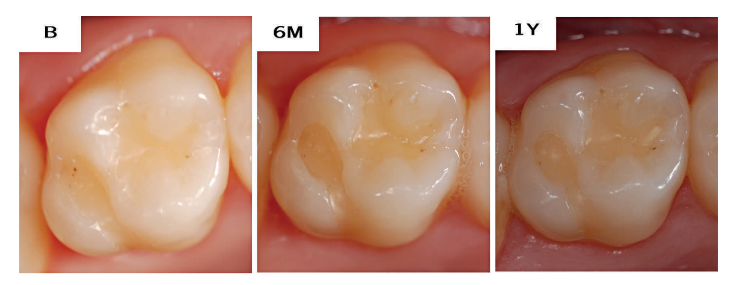
Figure 2. First molar. Occlusal restoration with Adper Scotchbond 1 XT and Filtek Z250. This restoration preserved its original aspect after six months and one year. No signs of adhesive deterioration were found. B, baseline; 6M, six-month recall; 1Y, one-year recall.

step self-etch adhesive in which water is separate from the adhesive solution to increase stability of the material.<sup>31</sup> In fact, conventional methacrylate monomers undergo rapid hydrolysis under acidic aqueous conditions.<sup>31</sup> Liquid A is a 2-hydroxyethyl methacrylate (HEMA)-water solution without etching capacity, and Liquid B is the solution containing the acidic monomers. The combination of acidic hydrophilic and hydrophobic monomers in the same solution (in this case, Liquid B) may cause a low degree of carbon double bond (C=C) conversion and increased permeability of adhesive interfaces. Other factors may be responsible for the marginal staining observed in the current study with SE. The change of color from pink to yellow that results from the adequate mix of Liquid A and Liquid B confirms that the acidic monomers have been activated (ionized). However, the activation of Liquid B into an etching agent, based on the superficial moisture provided by the 80% water in Liquid A, may result in an incomplete conversion of the acidic monomers. Their inclusion in a HEMA-rich and still-colored adhesive interface would enhance their susceptibility to hydrolytic degradation and, consequently, marginal staining.<sup>30,32</sup> This mechanism was corroborated by the presence of the characteristic pink color of Liquid A in most of the stained margins around Adper Scotchbond SE + Filtek Z250 restorations (Figure 1).